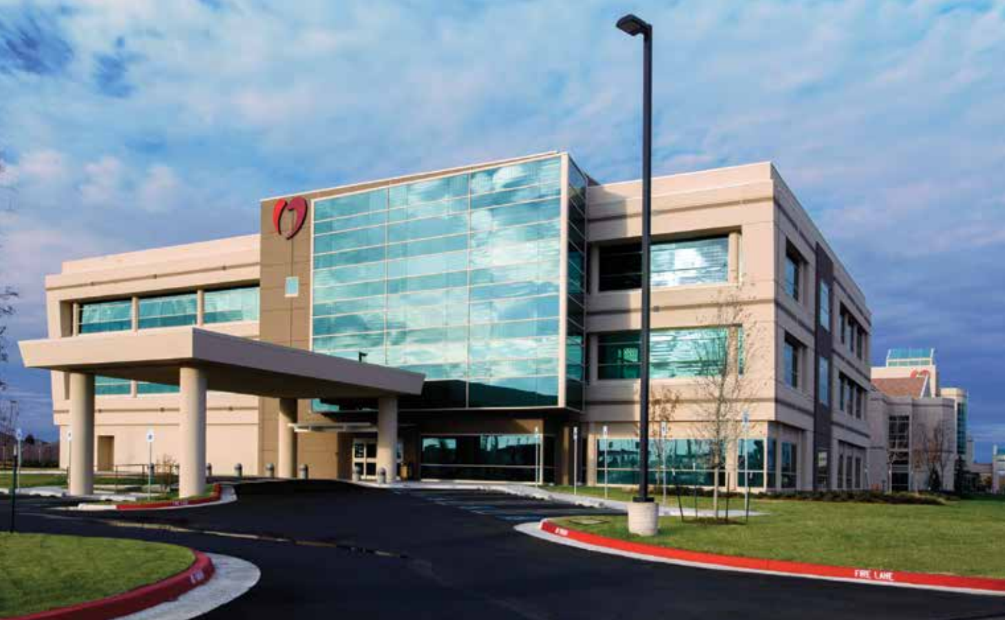
Oklahoma Heart Hospital Medical Office Building Oklahoma City, Oklahoma