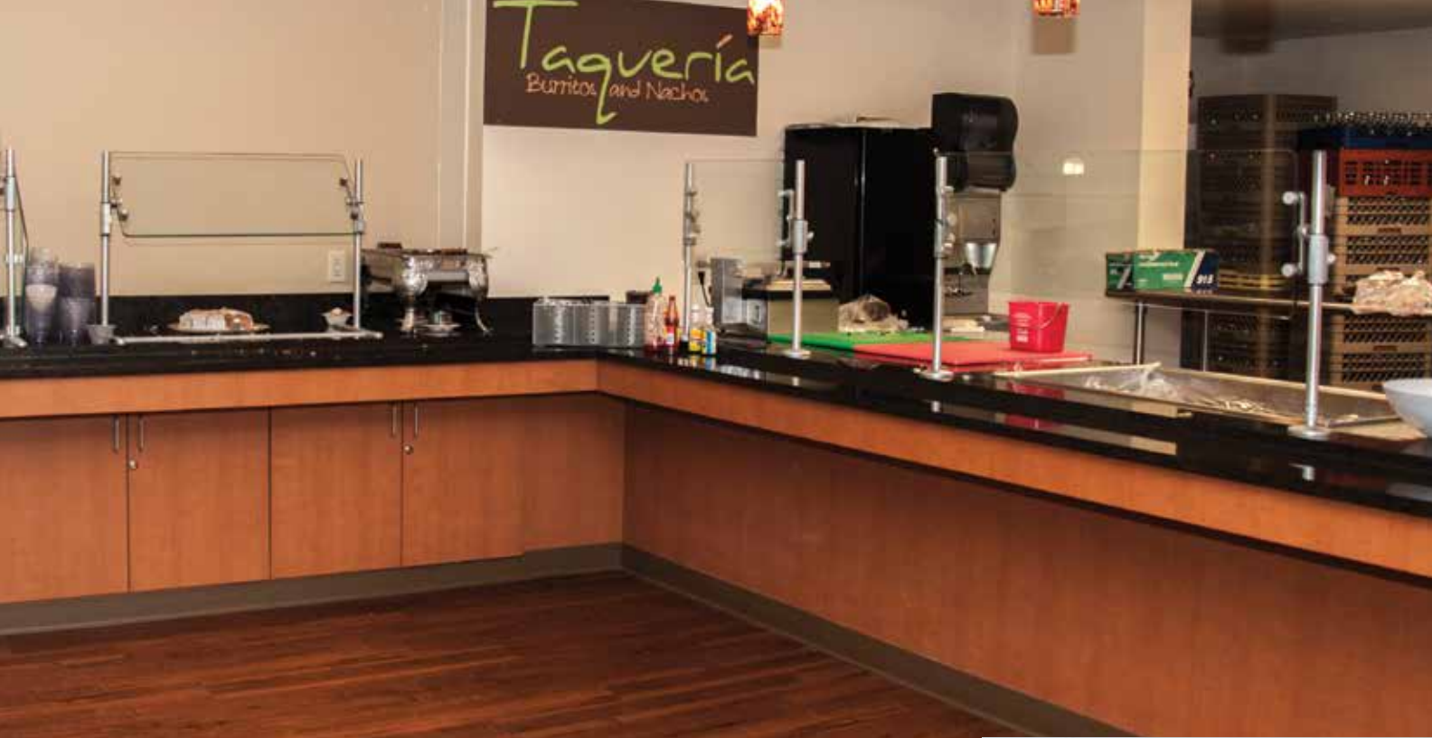
John Brown University Simmons Great Hall Siloam Springs, Arkansas