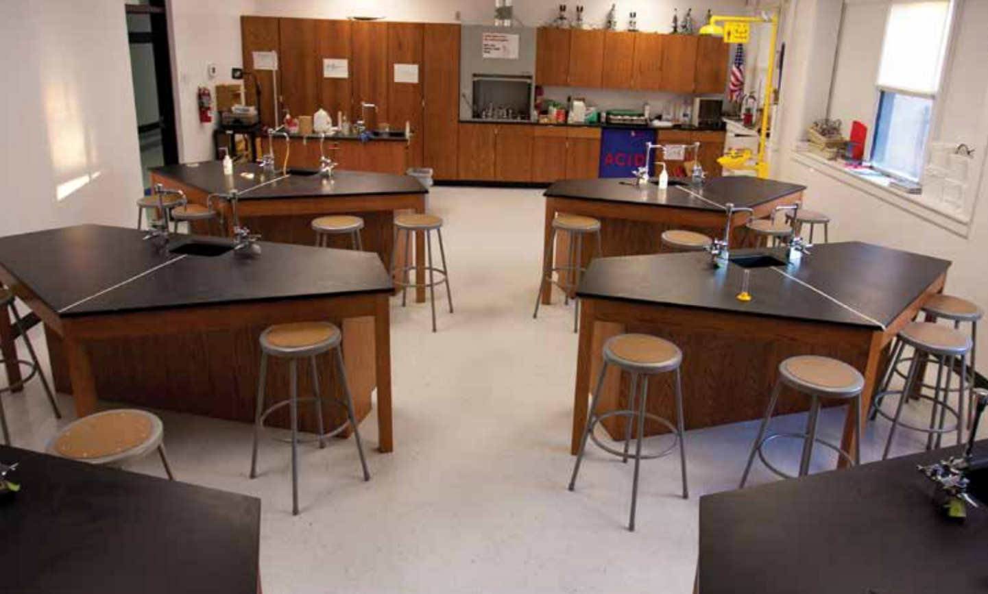
Wheatland R-II School District Wheatland, Missouri