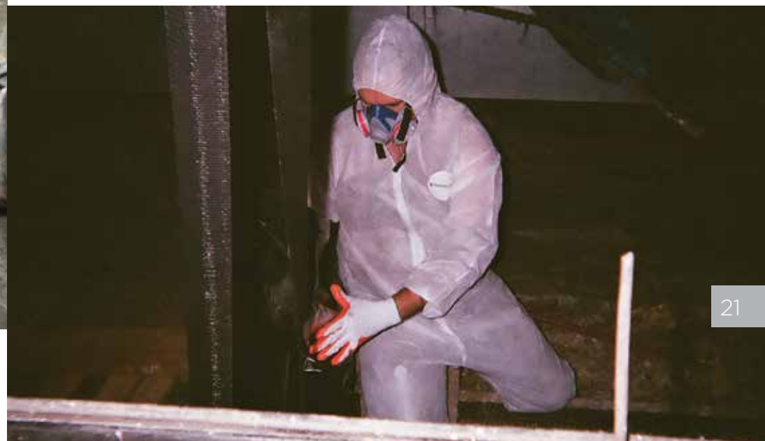
Organic matter clean-up