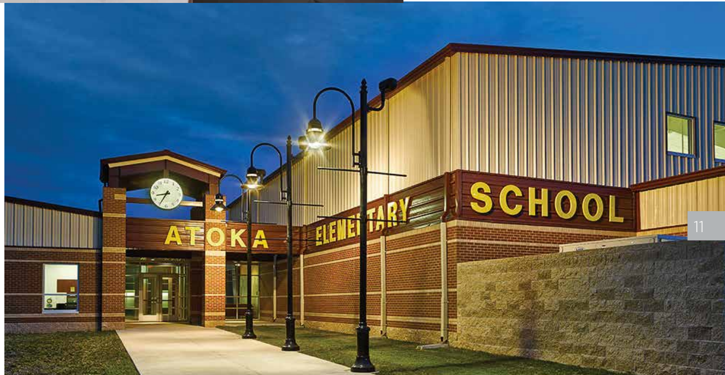
Atoka Elementary Atoka, Oklahoma