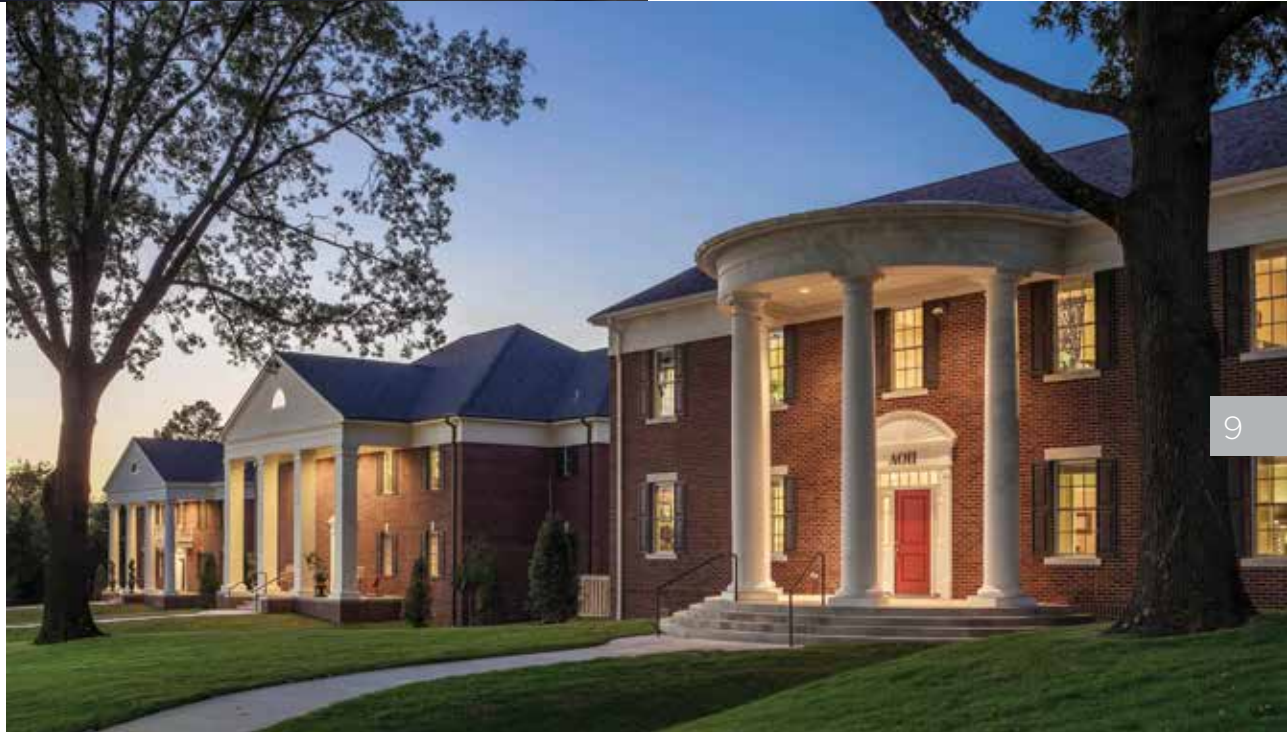
Arkansas State University Greek Village Jonesboro, Arkansas