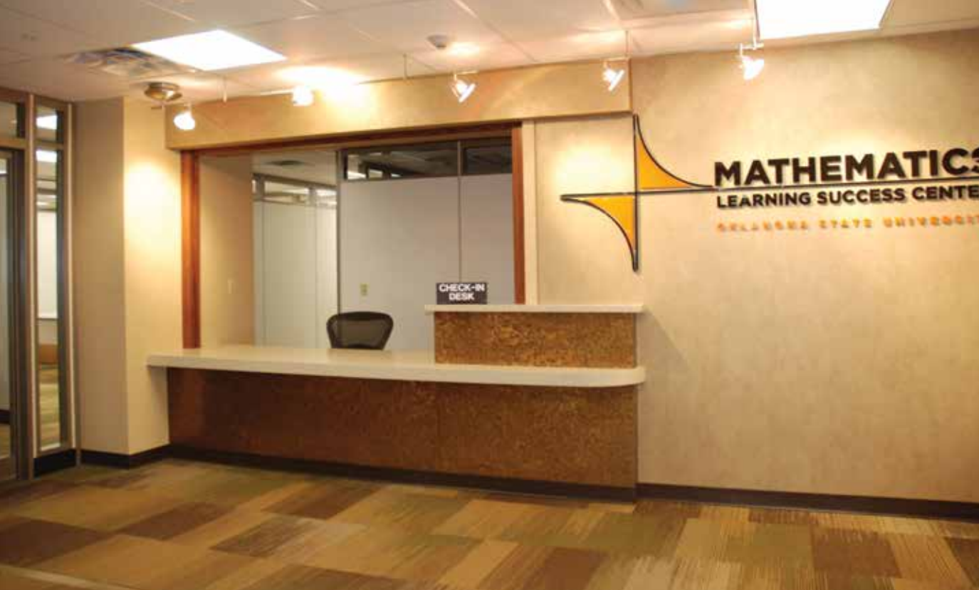
Oklahoma State University Mathematics Learning Success Center Stillwater, Oklahoma