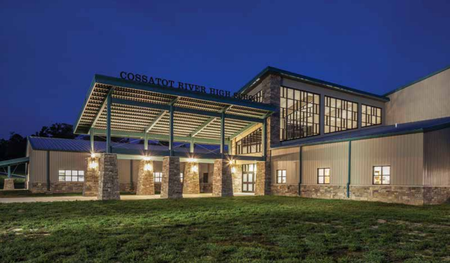
Cossatot River High School Wickes, Arkansas