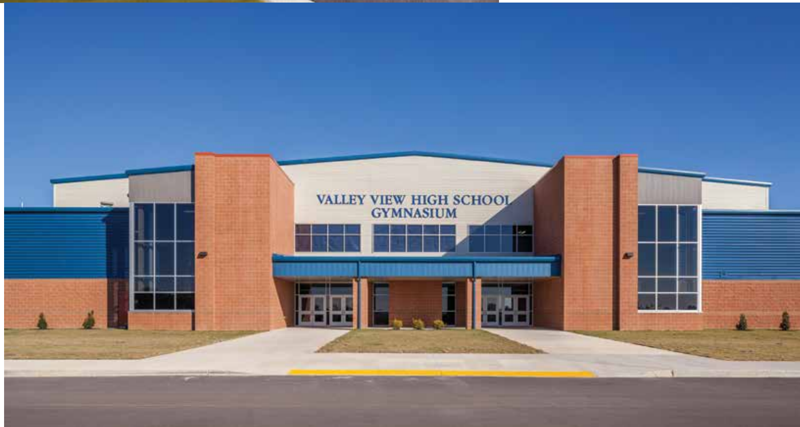
Valley View High School Jonesboro, Arkansas