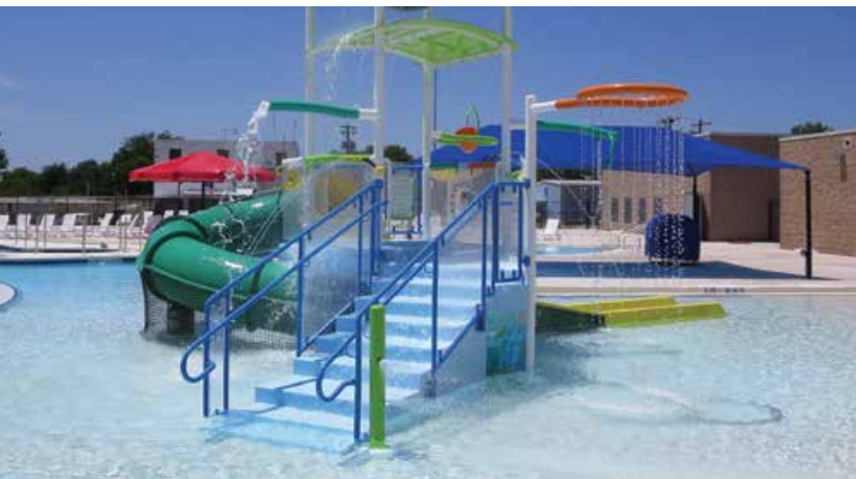
Pauls Valley Aquatic Center Pauls Valley, Oklahoma