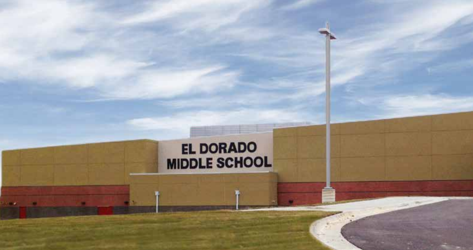
El Dorado Middle School El Dorado, Kansas