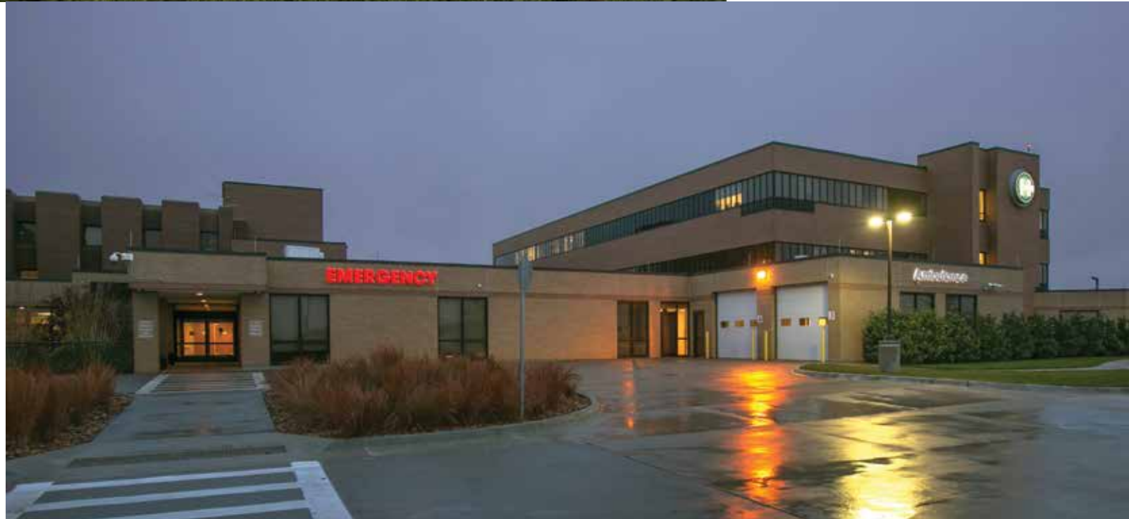
Hays Medical Center Hays, Kansas