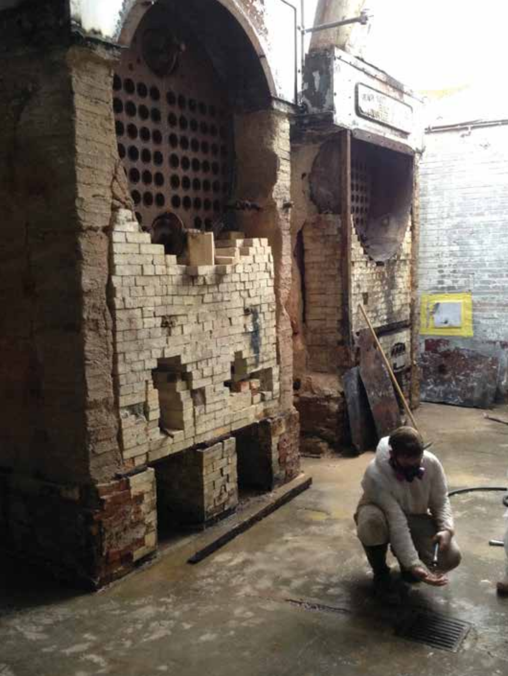
Removing asbestos insulation from boilers

(pictured left) Removing asbestos-containing floor tiles