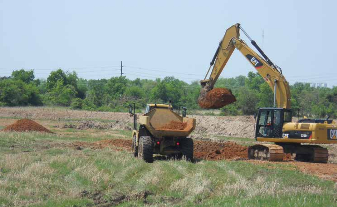
Rogers Regional Sports Park Rogers, Arkansas