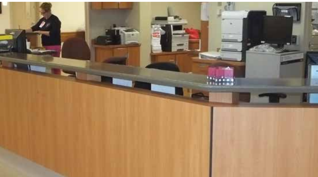
St. Mary's Hospital Russellville, Arkansas